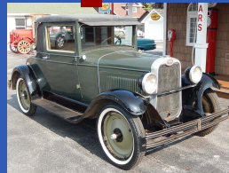
Newer model A