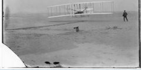
The third successful flight in 1905